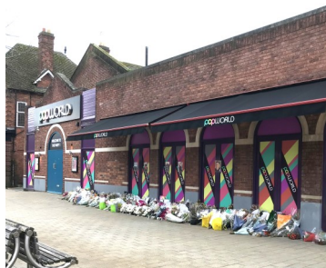
Flowers laid in memory of a pre Christmas stabbing outside Popworld on Poplar Road